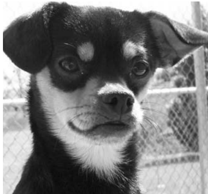
Pepper and Mel, currently in full training with Dogs for the Deaf